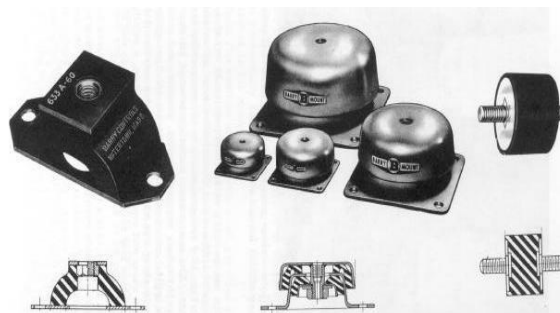
Fig. 2. Vibration isolaters products